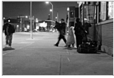
Prospective day laborers wait early one morning to be chosen for work.