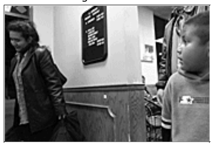
A family arrives in Kansas City, Missouri, from Mexico.